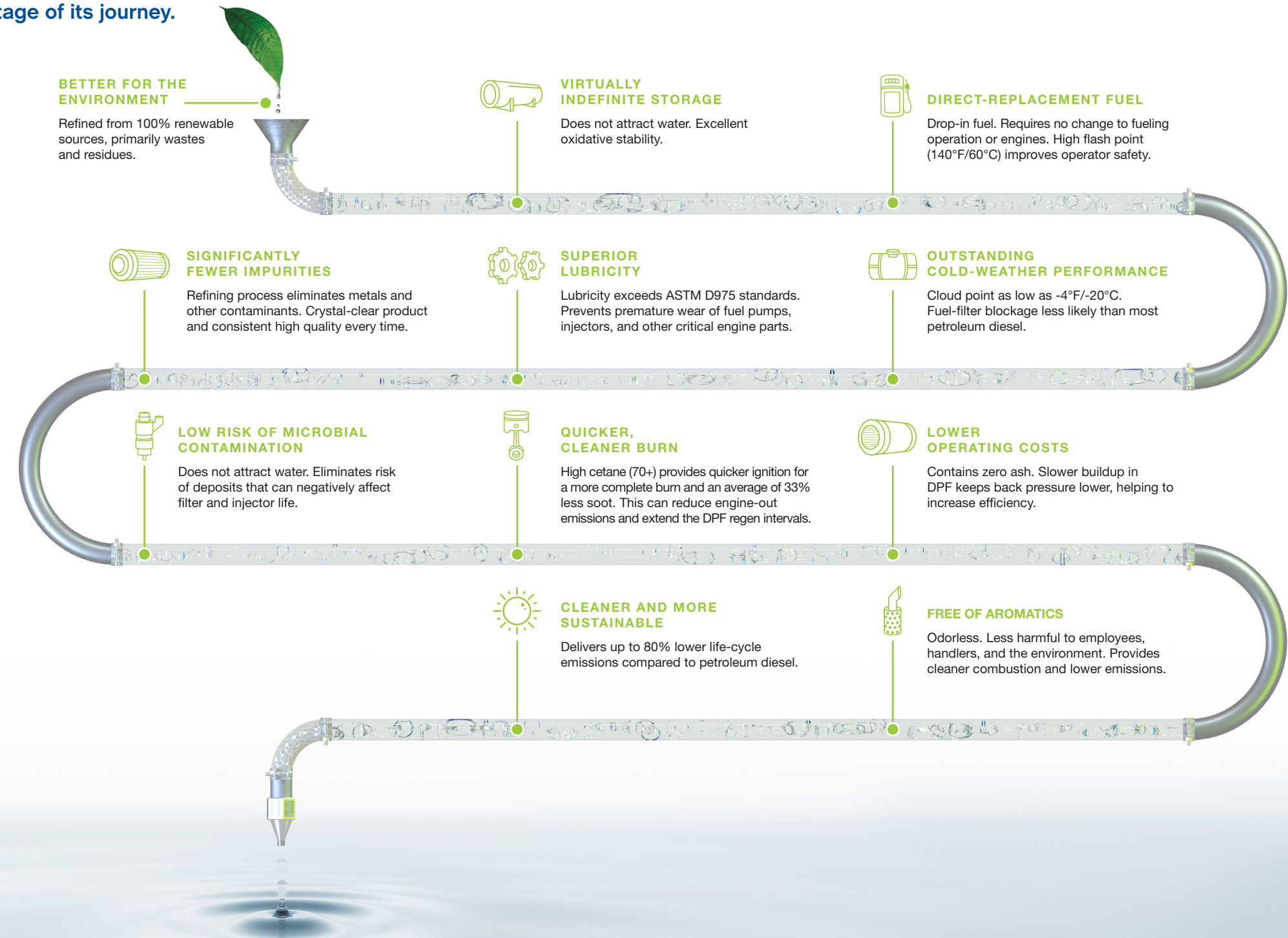
( NESTE MY )

Neste MY Renewable Diesel is a premium fuel produced from 100% renewable and sustainable raw materials. Cleaner burning and more efficient than conventional diesel, Neste MY Renewable Diesel is setting a new standard when it comes to performance—and the environment.