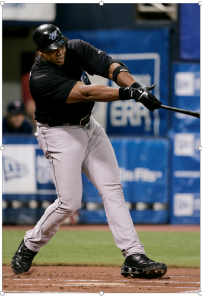
Frank Thomas 750 Chips