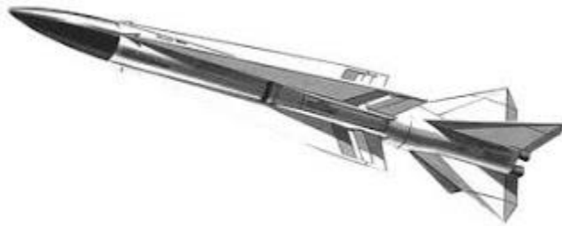
Overall configuration of the AAM-N-10 Eagle missile

The Westinghouse AN/APQ-81 radar would have been the most advanced radar of its day using pulsed-Doppler technology years before the first production pulse-Doppler radars would enter service. The radar had a maximum range against large aircraft of 120 miles and could track as many as eight targets at once. The radar could also send mid-course corrections to the Eagle missiles.