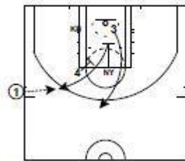
OT: 11.3; -6