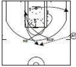
T: 21.4; -4) KCP FOR 3