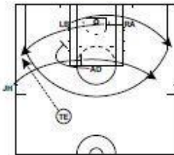
NOP EOG SOB-NEED 3 (@ DAL) ATO