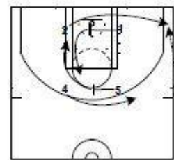
BROOKLYN SOB (SHORT CLOCK ATO