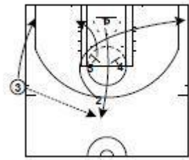
(T: 54; -3)