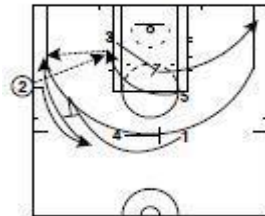
T: 19.2; -7