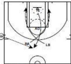
(T: 13; -3) RA FOR 3