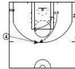
CHARLOTTE EOG SOB (VS NYK) ATO