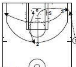
T: 7.3; -4