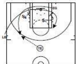
NOP EOG SOB - NEED 3 (@ UTAH) ATO