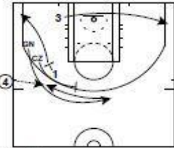
(T: 1.6; -4)