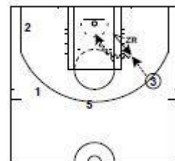
MEMPHIS EOG (VS SAC) ATO