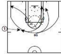
LA CLIPPERS EOG SOB (@ ATL) ATO