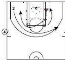
(T: 36.6; -2)