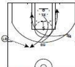
T: 16.3; -5