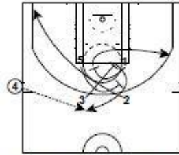
(T: 10.8; -3) 3 SCREENS TO 1 WHO SCREENS TO 5; 5 SCREENS 3;