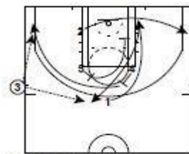
(T: 14.4; -5)