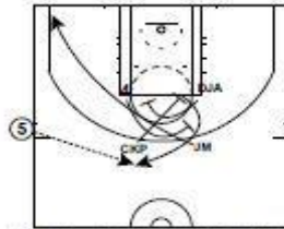
(T: 38.7; -5) 2 SCREENS TO 1 WHO SCREENS TO 4; 4 SCREENS 2; 5 DOWN SCREEN TO JM FOR 3