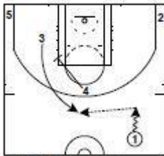
BOSTON EOG (VS DET)-FAVORITE ATO