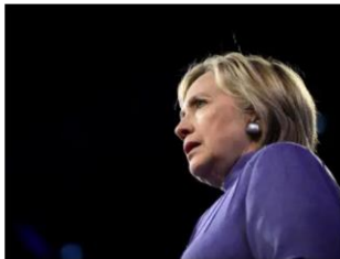
Hillary Clinton.

Hillary Clinton told investigators that she wasn't aware that a "C" marking in emails she received on her private server indicated that the information was classified at the "confidential" level, according to documents that the FBI released on Friday.