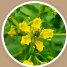
Graveolens & Hyaluronic Acid

CLICK HERE - OFFICIAL ILLUDERMA WEBSITE (24 HRS OFFER)