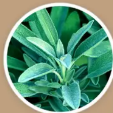
Sage & Vit. C