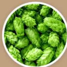
Hops & Vit. E