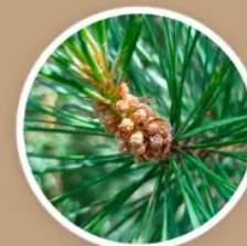
Lemon Peel & Scots Pine