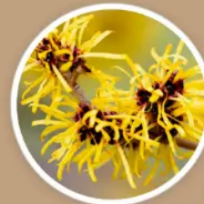
Witch Hazel & Horsetail